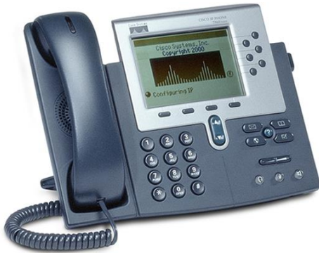
Figure 1. Cisco Unified IP Phone 7960G

The Cisco Unified IP Phone 7960G, a key offering in the IP Phone portfolio, is a full-featured IP phone primarily for manager and executive needs. It provides six programmable line/feature buttons and four interactive soft keys that guide a user through call features and functions. Audio controls for duplex speakerphone, handset and headset. The Cisco Unified IP Phone 7960G also features a large, pixel-based LCD display. The display provides features such as date and time, calling party name, calling party number, and digits dialed. The graphic capability of the display allows for the inclusion of such features as XML (Extensible Markup Language) and future features.