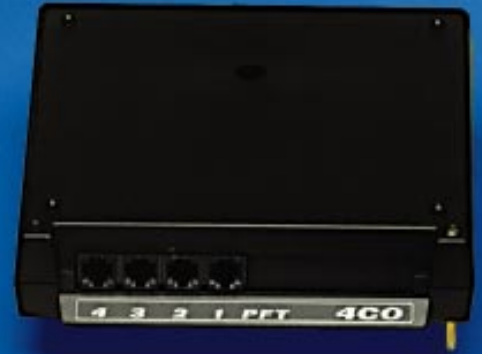
4 CO Module