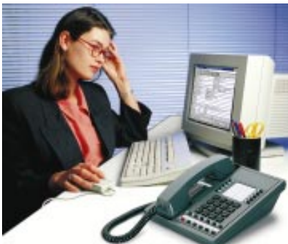
Digital System/01 automates your office with TAPI compatibility and external PC control.

Telemarketing Dial - enables your staff to canvas prospects quickly and efficiently.