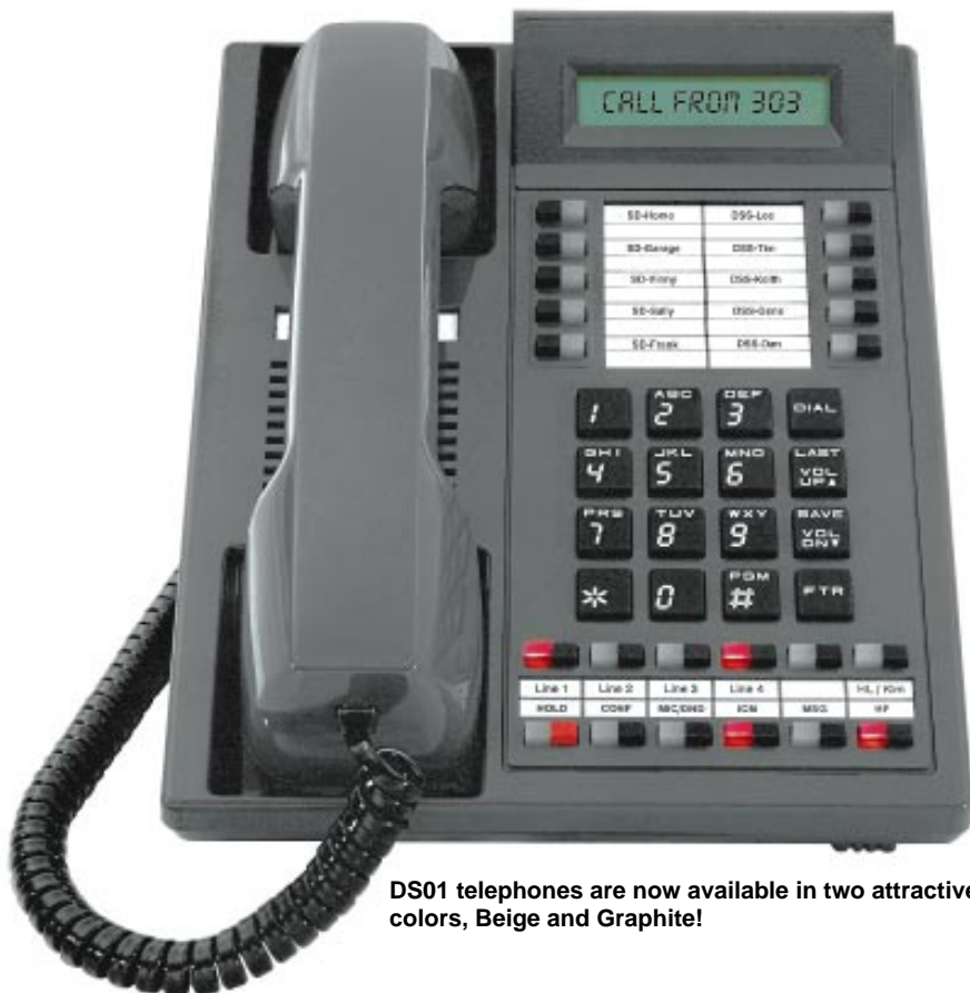
DS01 telephones are now available in two attractive colors, Beige and Graphite!