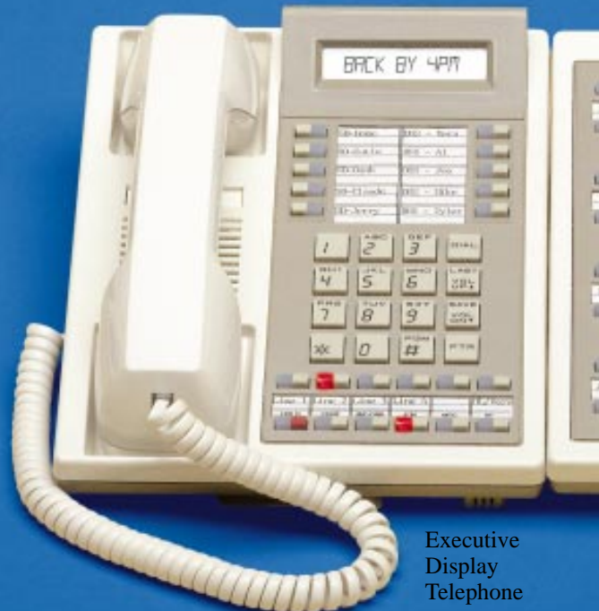
Executive Display Telephone