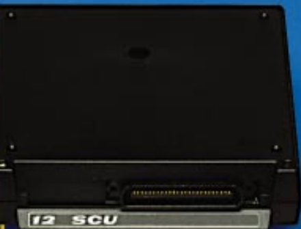
12 Station Module

Digital Single Line Telephone with message waiting indication.