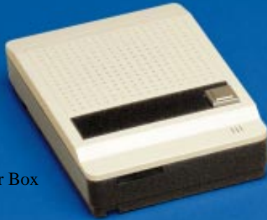
Digital Door Box

The Common Equipment Unit (CEU) is the heart of the Digital System/01. One CEU supports up to eight lines and 24 phones. Two CEUs give you up to 16 lines and 48 phones. Add a third CEU and grow to 24 lines and 72 phones.