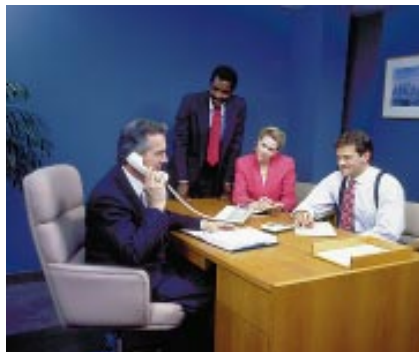
Group Call Monitoring allows everyone in the office to hear the whole story without using the speakerphone.

Speakerphone - make or answer any call while you keep your hands on the job.