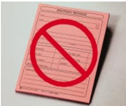
Eliminate message slips with personalized integrated voice mail.

More and more businesses – from the biggest to the smallest – are finding out that digital technology can help them get more out of every working day. And without a doubt, the digital system that makes the most sense is Digital System/01.