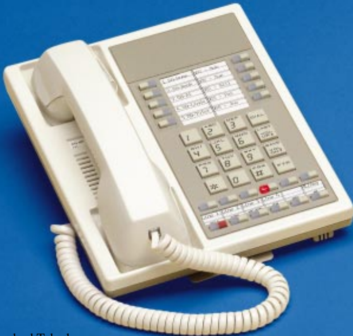
Standard Telephone with or without optional speakerphone.