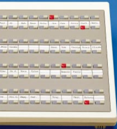
80 Button DSS Console

Executive Display Telephone 16-character LCD display provides time, date, number dialed, line in use and called or calling extension number, in addition to Display Messaging capability and speakerphone.