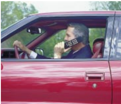
Office calls can be forwarded to any phone, even to your car.

Call Coverage - any employee can pick up any phone to answer incoming calls. The phones are always covered.